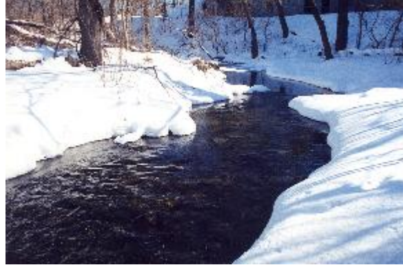
Wildwood Lake Sanctuary, Dauphin County