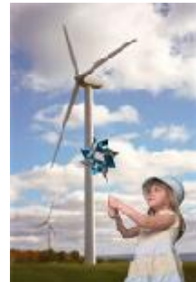
PECO Wind Energy