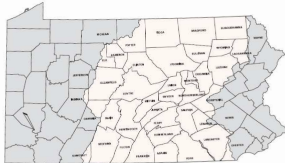
White area is Chesapeake Bay drainage