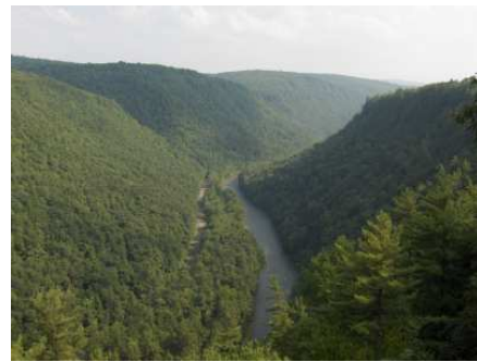
Pennsylvania Grand Canyon

The meetings will be held on November 1 at 6:30 p.m. at the Wheeland Center on the corner of Locust and Cemetery streets in Jersey Shore, and on November 3 at 6:30 p.m. at the Pennsylvania College of Technology campus on Route 6 in Wellsboro.