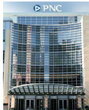
PNC Firstside Center Pittsburgh . Silver LEED green building rating.