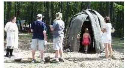
Lenape Nation – Tradition of Caretaking.