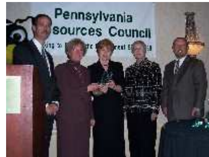
PA Resources Council 2005 Award Winners