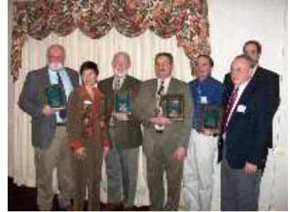
Award Winners Eastern Sports & Outdoor Show