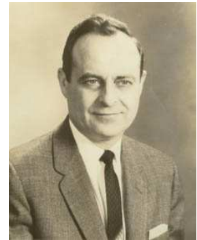
PAEP Environmental Heritage Project