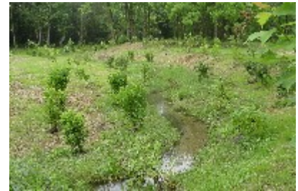
Restoration of McIlvaine Run