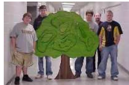
Environmental Education Alive and Well in Armstrong County