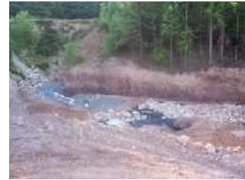
Audenreid Treatment Project – Catawissa Creek